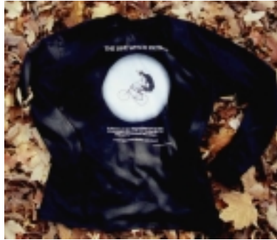
Tee shirt imprint copyright © 2000 by James Guilford

In October of 1994, three student framebuilders disappeared in the woods near Bentleyville, Ohio while testing mountain bike designs. A year later their bicycles were found.*