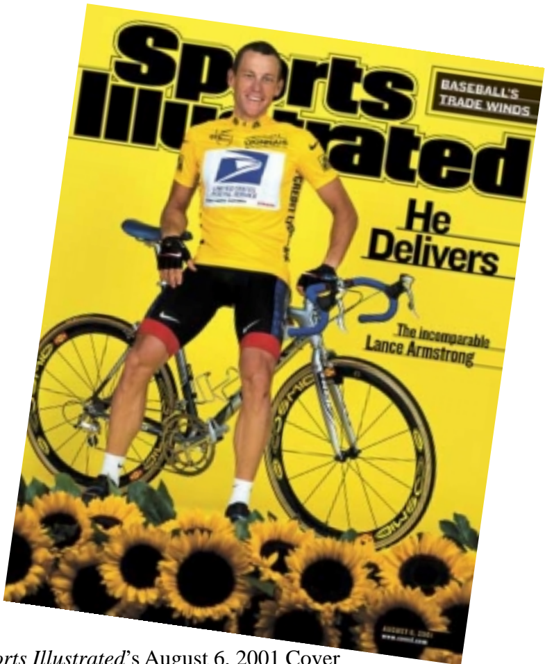
Sports Illustrated's August 6, 2001 Cover